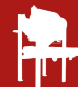
Fondant Crème Plant