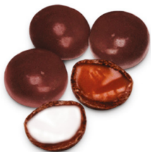
Small Chocolate-Panned Toffee & Fondant