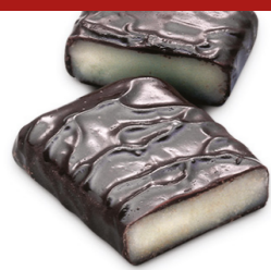
Enrobed Fondant Bar

For more information on Fondant & Fondant Crème Plants please click on the link: www.bakerperkins.com/FFCP