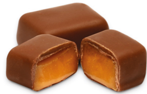
Enrobed Caramelised Fondant