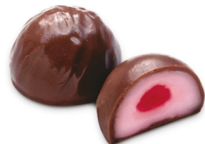
Enrobed Centre-Filled Fondant Crème