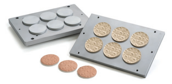
We make also stamping dies if required.