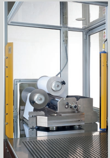
Modello LV 120 B