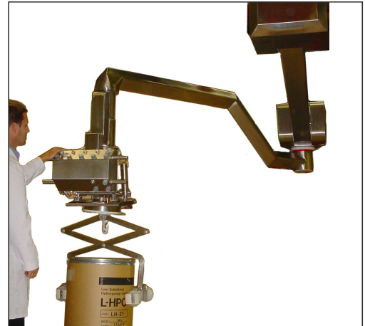
Utility attachment guaranteed to lift any drum within 300mm diameter range.