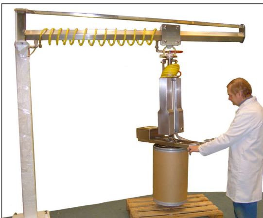
ATEX pneumatic vacuum lifting solution - PalPharmAssist™