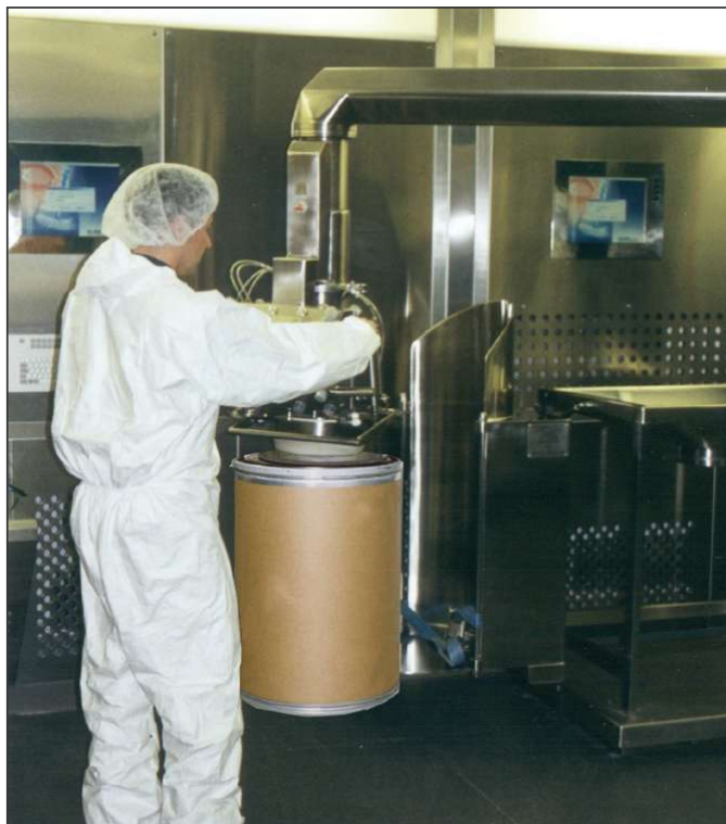
Overhead mounted PalPharmAssist™ suitable for transporting drums from an aluminium cage and loading a PalPharma Tip™ within a containment booth