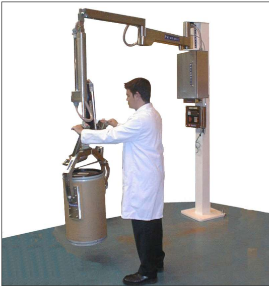
Gantry mounted PalPharmAssist™. Suitable for palletising and 'check' weighing drums or kegs.