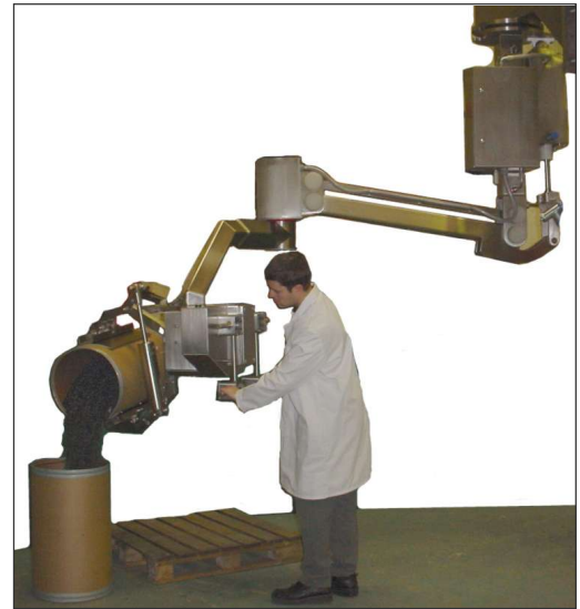
Overhead supported unit with pneumatic grippers to grip and pour fibre drums up to 120kg in weight