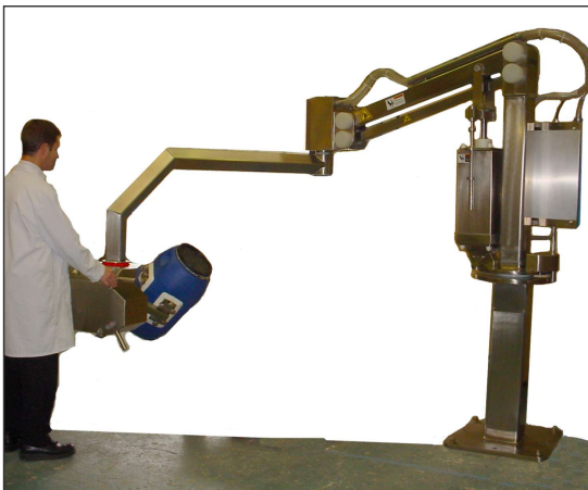
Floor mounted PalPharmAssist™ utilising vacuum grip to lift and pour contents of HDPE drums.