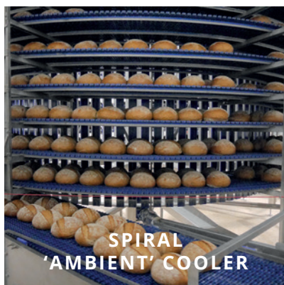
SPIRAL 'AMBIENT' COOLER