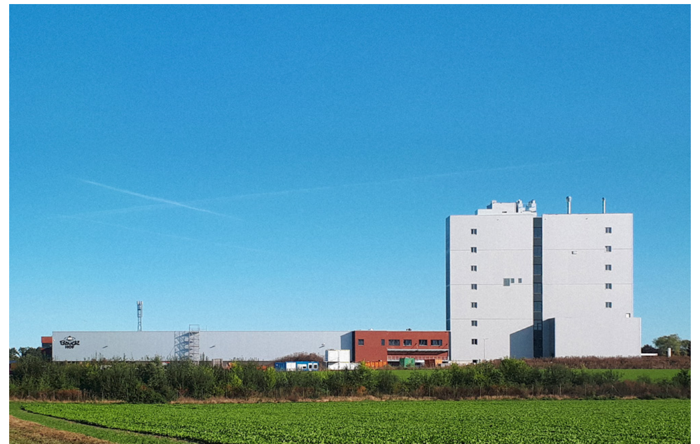
↑ Oat plant of the company Bauck