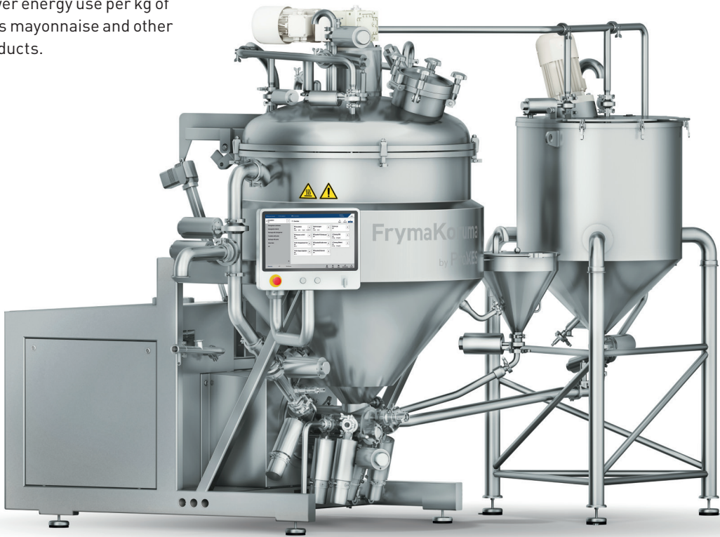
Proxx D® 700 Vacuum processing unit

The new technological advance of ProxxD® enables higher production volumes by lower energy use per kg of product such as mayonnaise and other emulsified products.