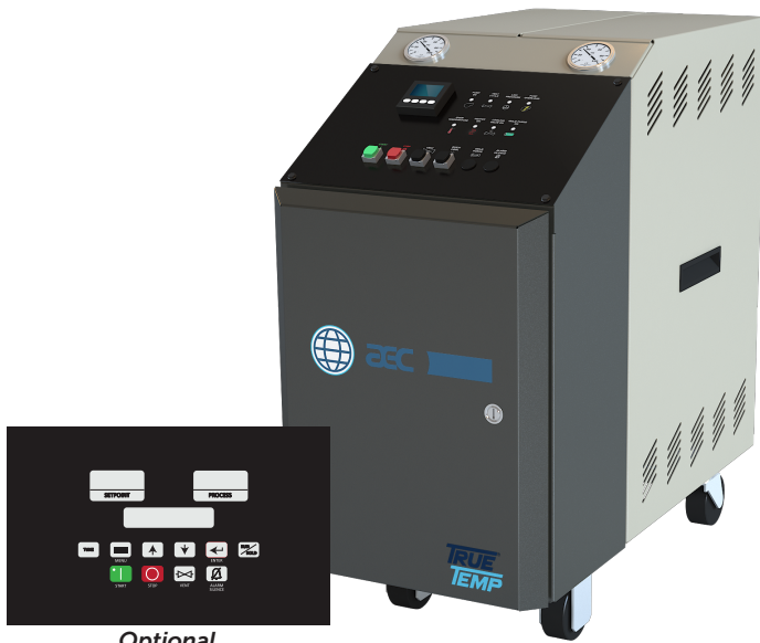
Optional Advanced M2C Controller

Innovative design promotes turbulent water flow to maximize heat transfer performance. High flow pumps with 32°F to 250°F (0°C to 121°C) setpoint operating range. The cast-and-flange design reduces connection points by 40% while including high-efficiency pumps that offer higher flow rates at lower pressures. These highly efficient products maintain temperatures to within 1°F of setpoint, allowing for tighter temperature control and improved throughput.