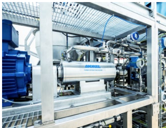
Turbex pilot unit