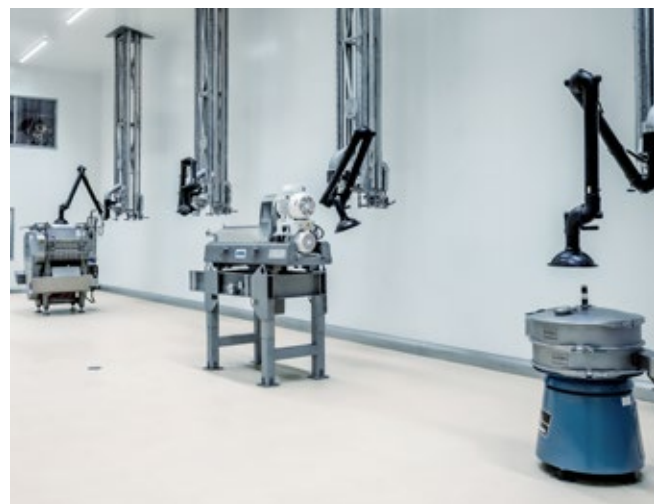
ANDRITZ Food Innovation Xperience (FIX) center

The ANDRITZ team looks forward to welcoming you and to discussing the possibilities and benefits. Let's IMAGINE – EXPLORE – CREATE together!