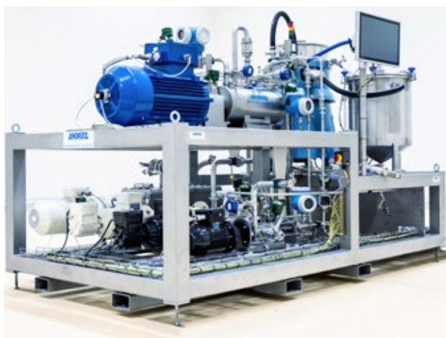
Turbex mobile unit