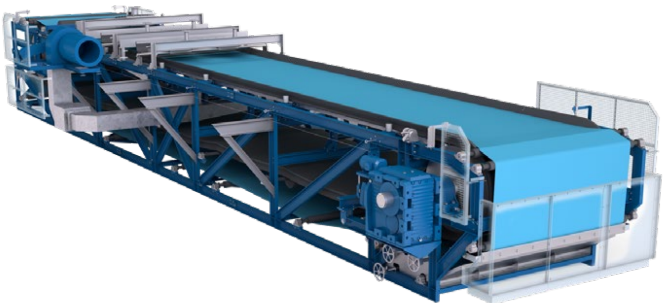
Horizontal vacuum belt filter