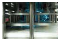
▲ Pressing & Filming