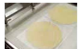
▲ Pressing & Filming