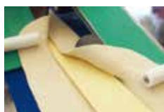
▲ Wrap the margarine