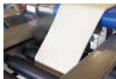
▲ Layer Folding