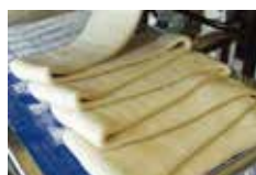
▲ Layer Folding