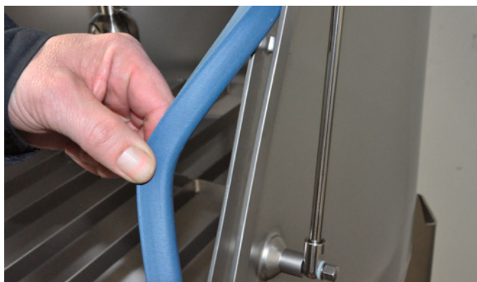
Gasket easy to remove and install as no adhesive is required