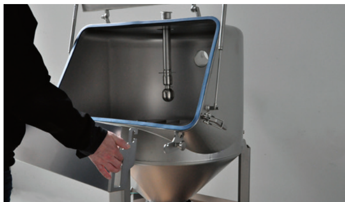
The sack support can be folded down or detached

Connection: Clamping ring connection 2" DIN 11866 Series C