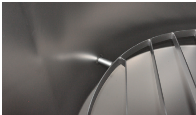
No open threads on the inside