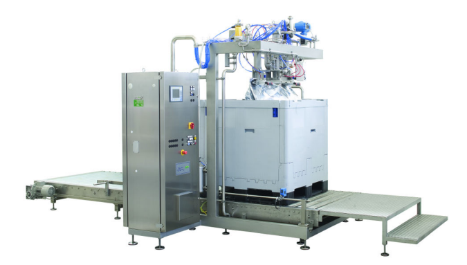
Automatic Astepo clean bag-in-box filler for 3 - 20 I bags

If the small-bag production output exceeds 100 bags per hour an automatic bag feeder for web-type bags is added under the filling valve. This ensures output of up to 350 bags per hour.