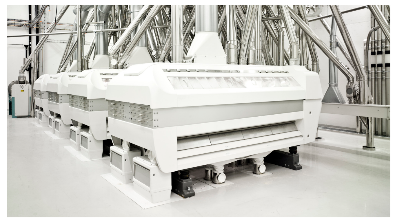
The purifier Polaris MQRG: Guarantor of highest profitability and pure end products.