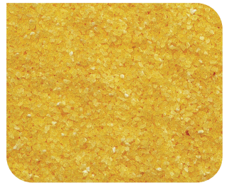
Pure semolina for highest quality standards.