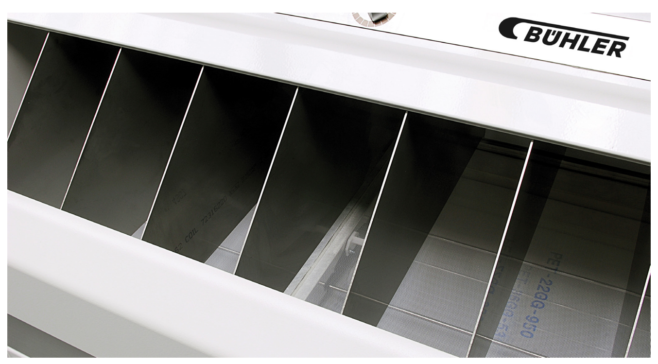
High-grade materials for absolute sanitation.