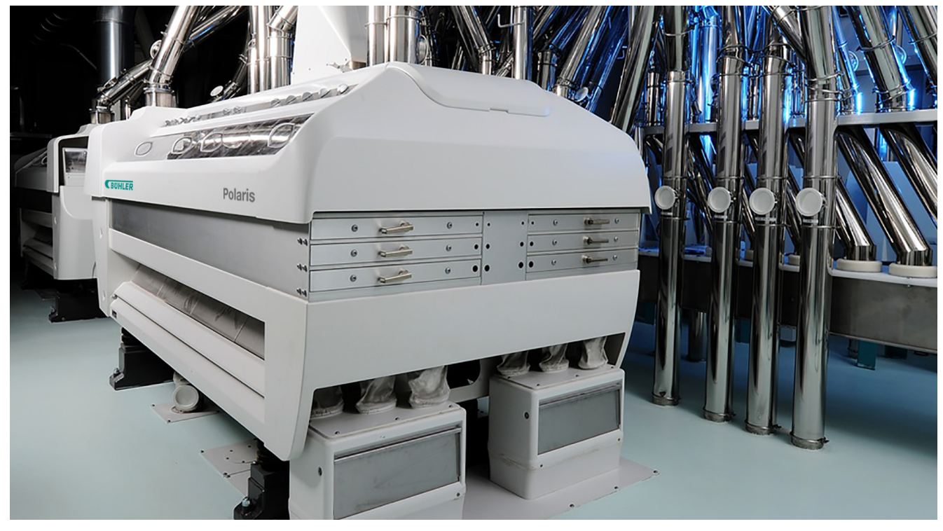
Polaris impresses with its fascinating performance and the groundbreaking design.