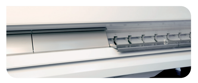
Covers at the product outlets for high product safety.

The completely enclosed machine satisfies the most rigorous international food standards (FDA, BRC, IFS). Its components in contact with the product are made of stainless steel or other high-grade engineered materials to ensure the highest sanitary conditions.