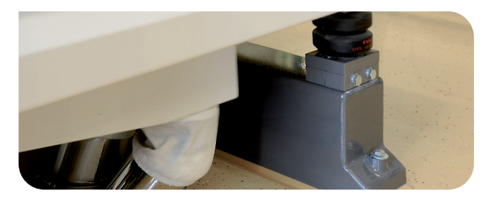
Low-maintenance vibration mounts for long operating times.