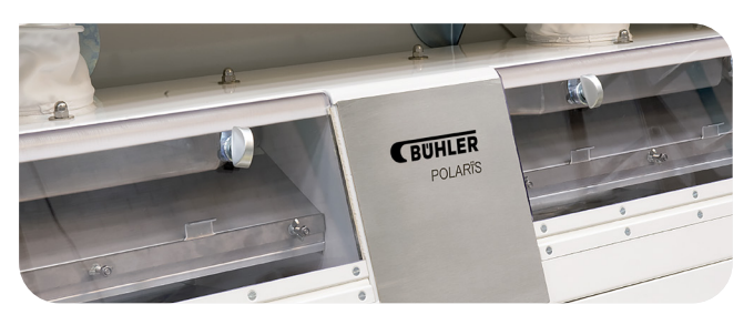
Optimized feeder device.

With its screen width of 520 mm – and a screen length of 4\times500 millimeters – Polaris boasts a greatly increased work area. Thanks to its sophisticated design, Polaris does not require more space than conventional models. In addition to the increased screen area, the air flow inside the new machine has been optimized as well.