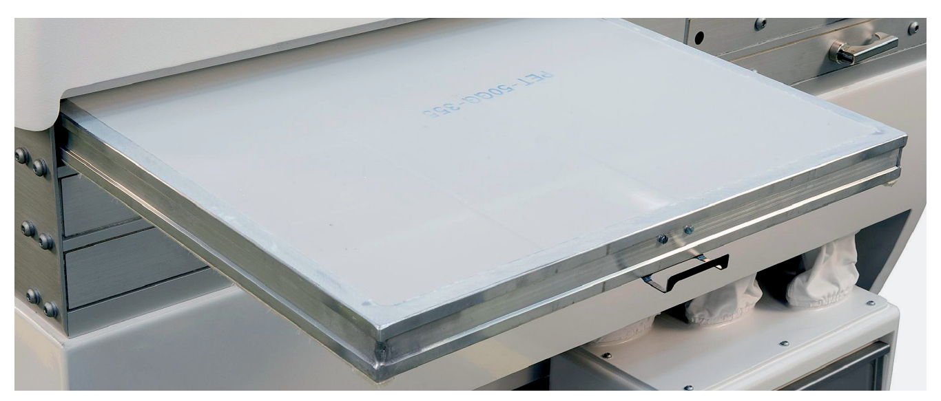
Simple tensioning system for extremely efficient maintenance.