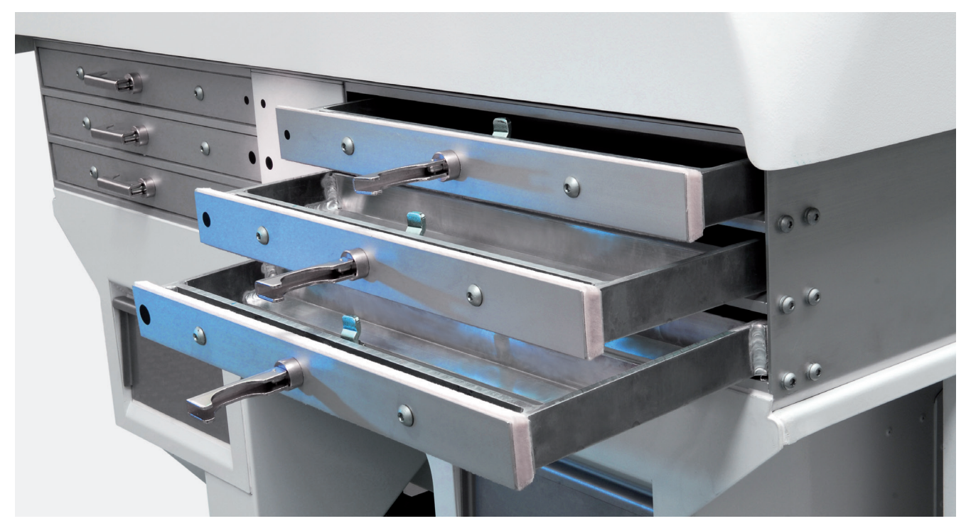
Quick and easy access to all sieves in the machine.