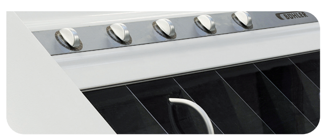
User-friendly design for easy operation.