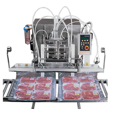
Perfect for Individual bags or Case-Pack ready