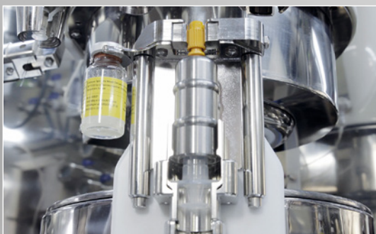
Support for vial/syringe