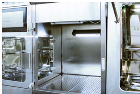
LAF hood for sensitive material inlet