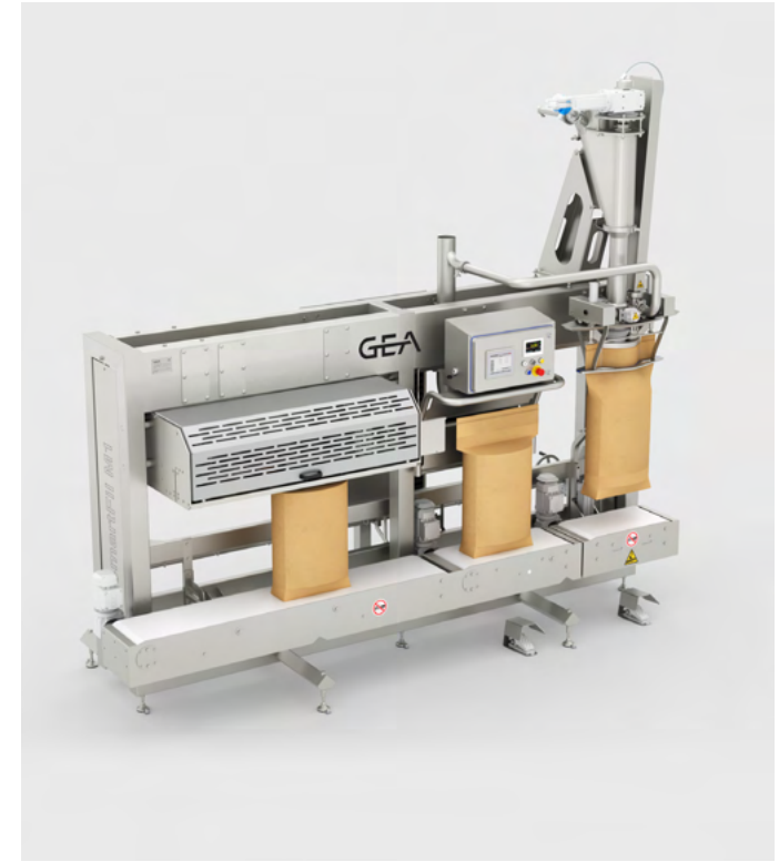
GEA SmartFil M1 with auger and continuous sealer