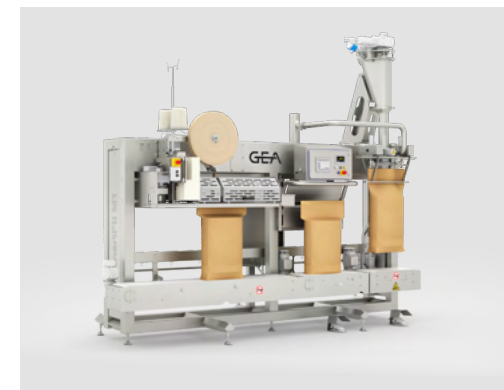
Auger, bag, seal & sewn