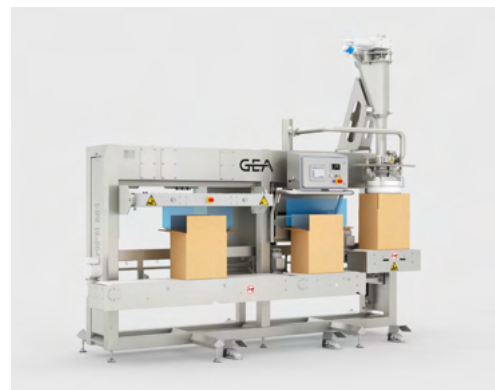
Auger, box & impulse seal