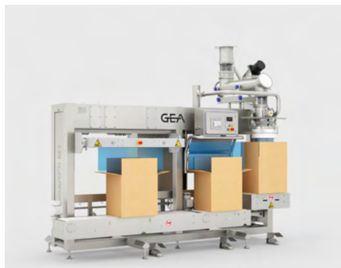
Vibratory feeder, box & impulse seal