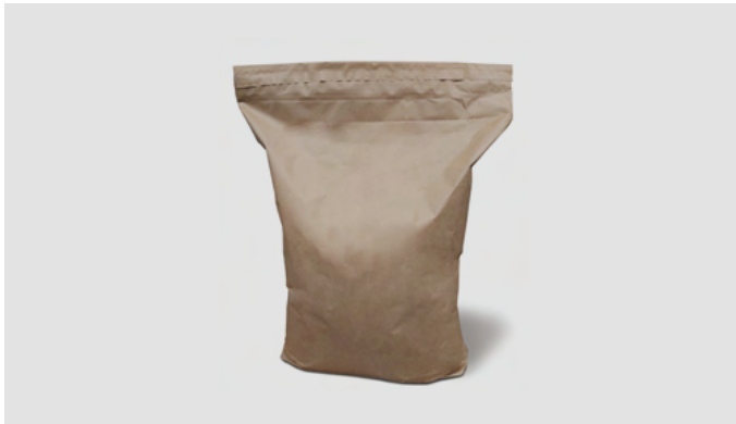
Bags - Multi-Wall / Plastic, Pillow, Step-Top / Flush-Top

The SmartFil M1 is designed to handle a variety of different packaging types, selected at the time of order.