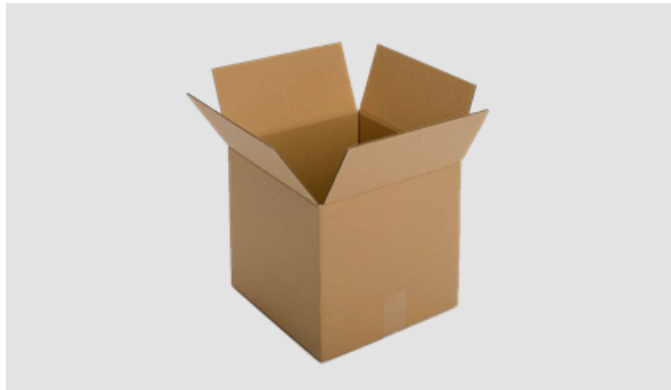
Boxes / Cartons - Regular slotted Carton (RSC)