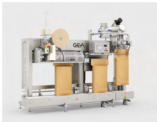
Vibratory feeder, bag, seal & sewn

Different options that can be swapped (auger, vibratory feeder, deaeration probe, continuous sealer, sealer/sewing, impulse sealing)