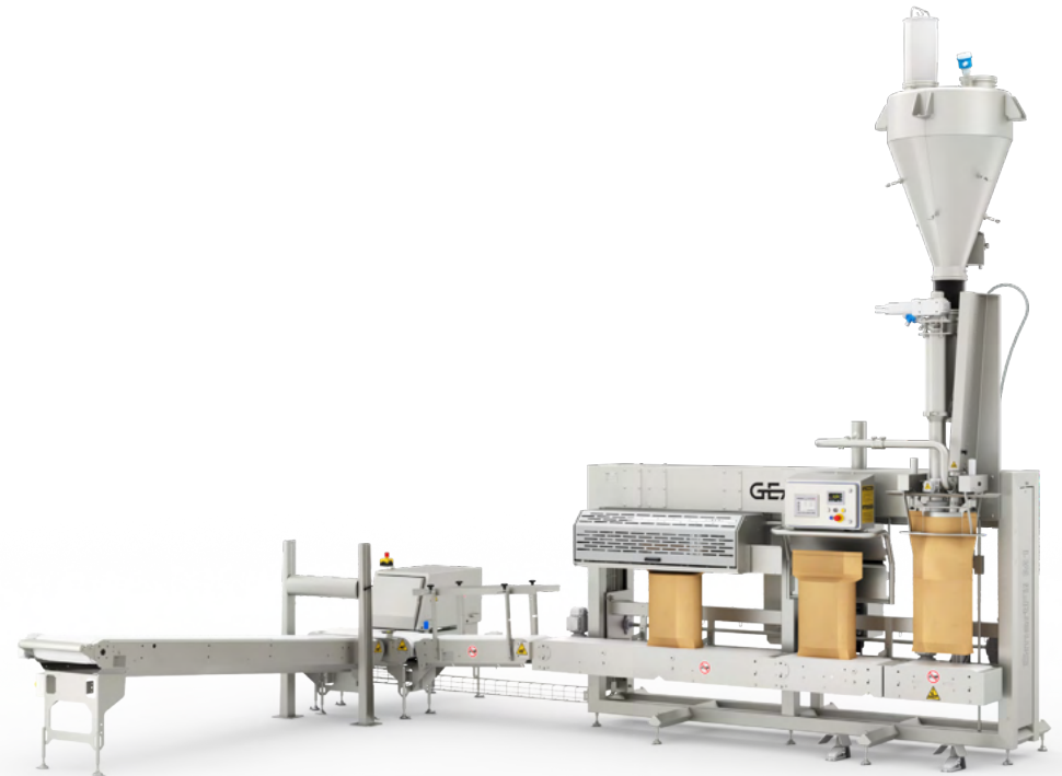
Complete GEA SmartFil M1 with auger, continuous sealer and downline

Emerging markets, low volume producers and pilot plants all require a compact and flexible low rate packing operation to meet their needs. With diverse product portfolios, primary producers require the ability to tailor their packing solution accordingly. This is where the all new GEA SmartFil M1 delivers!