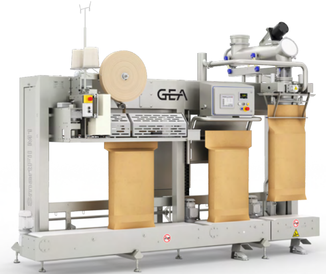
Vibratory feed system with sealing and sewing integrated