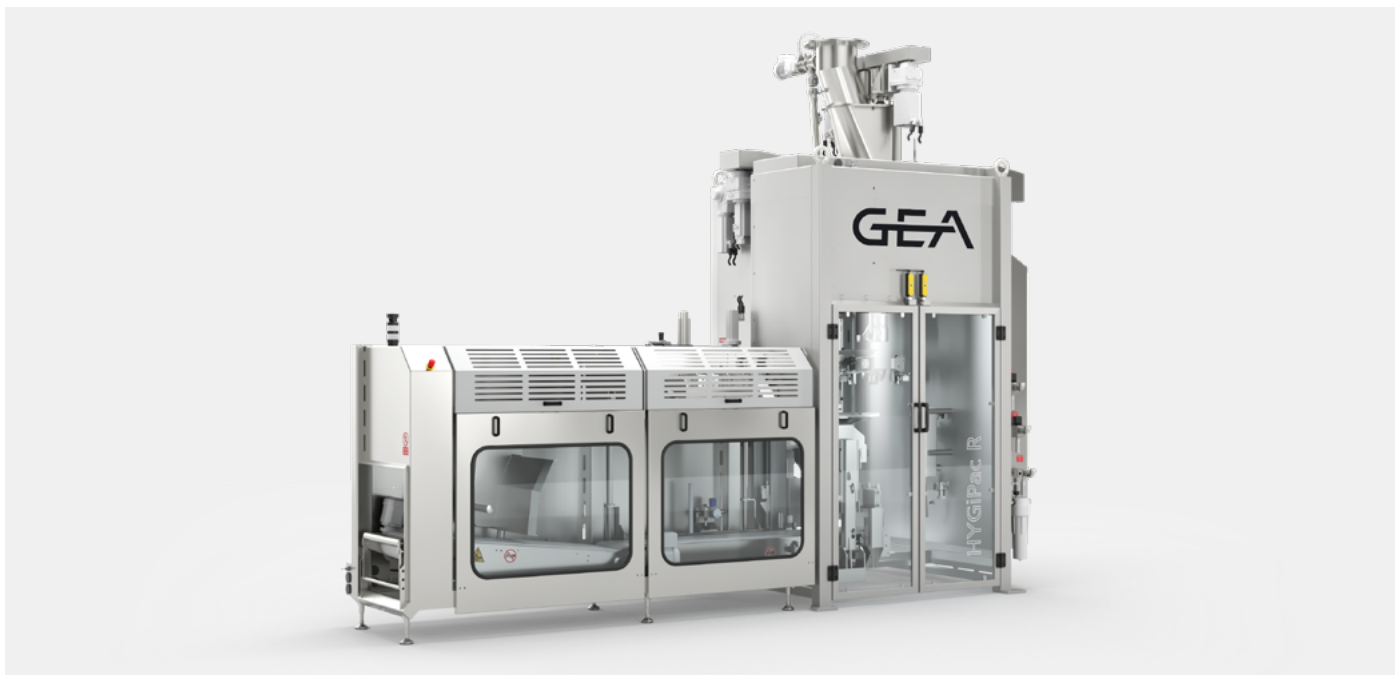
HYGiPac R1 filler