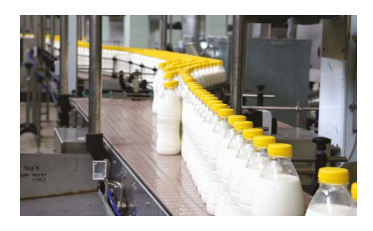
Based on production/package requirements, the conveyor design can include bottle aligners/dividers and dynamic accumulation tables.