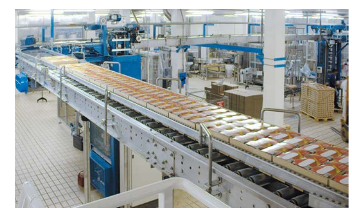
GEA's product range includes the most diverse solutions suitable for handling cartons and crates of very different sizes and consistencies.