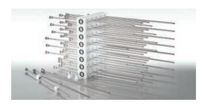
Special cassette design

An innovation to speed up changeover as well as simplify cleaning is the special design of the cassettes that consist of a manifold with needle guides and needles. Complete cassette assemblies are easily exchanged without tools to speedily switch needles patterns or needle types. If required, individual needle guides can also be replaced one-at-a-time without dismantling the manifold, which makes it easier to exchange a leaking guide.