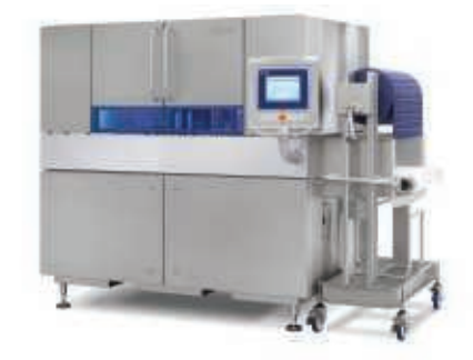
GEA MultiJector with removed conveyor belt