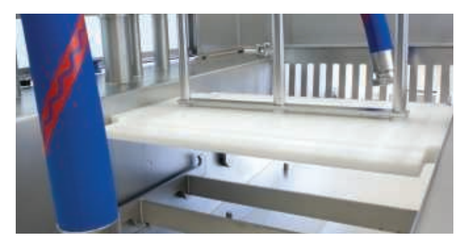
Cleaning position of needle head