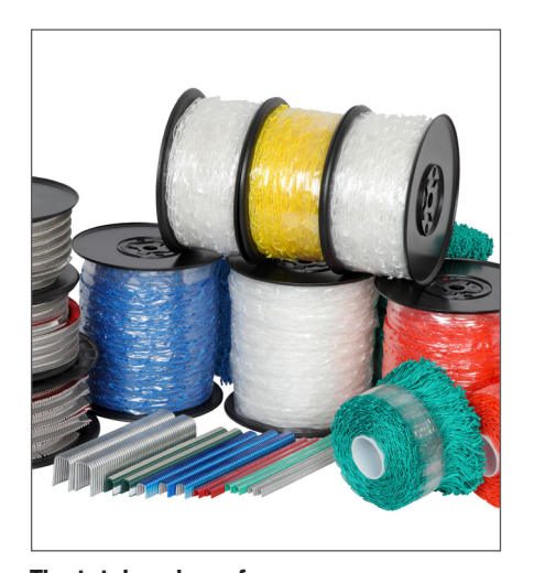
The total package from one manufacturer: clipping machines, clips and loops.

Width: 2.339 mm (92.08") Depth: 1.295 mm (50.98") Height: 1.756 mm (69.13") 3x400 V, 50 or 60 Hz Supply voltage: 2.8 kW Fuse protection: Protection class: IP65 Air consumption: 0.39 nl/cycle 6-7 bar (87-101 psi) Compressed air: 45-160 mm (2-6.3") Caliber range: Speed: up to 120 portions/minute Clip type: E400 series / Z400 series Loop type: TeQu-S 250 mm Total spreading: Noise level: 75 L<sub>DA</sub> [dB(A)] (according to EN ISO 11204) Weight: 800 kg (1.763 lbs)