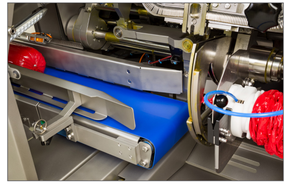
Telescoping conveyor and pneumatic casing brake