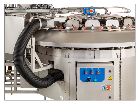
Simple, highly visible control panels make it easy to manage vital functions like start/stop, vacuum pump, rotating product table, and bag tail takeaway.