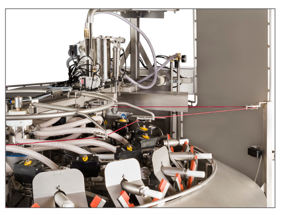
New design features like enlarged clipper guarding screen and red safety cable above the rotating product table enhance operator safety.

Both models may be ordered as a "Super" Rota-Matic. Ideal for large cavity products, the Super Rota-Matic features larger vacuum nozzles and an optional second pump, enabling faster air evacuation for maximum production speed.