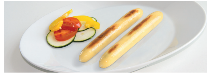
\uparrow Cheese sausage