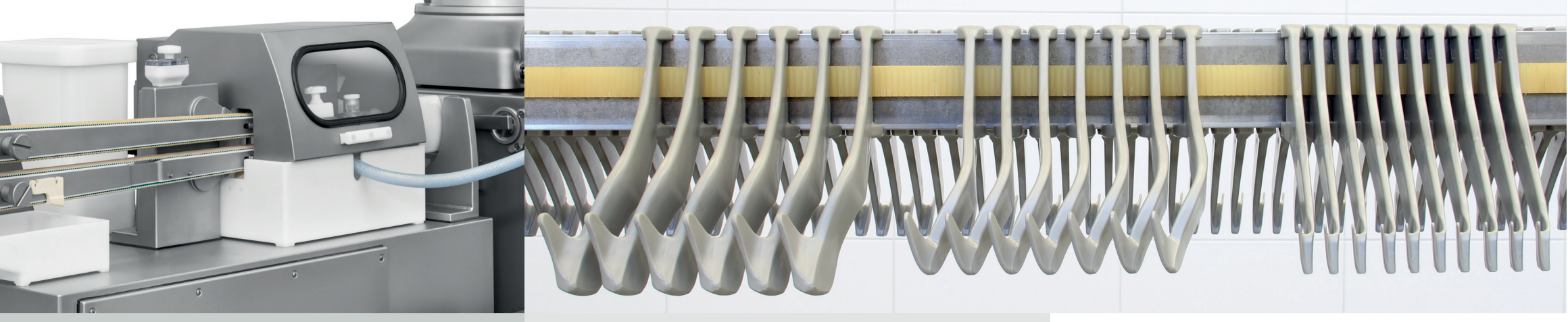
↑ Different hook versions for different applications