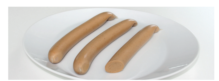
↑ Vegan wieners