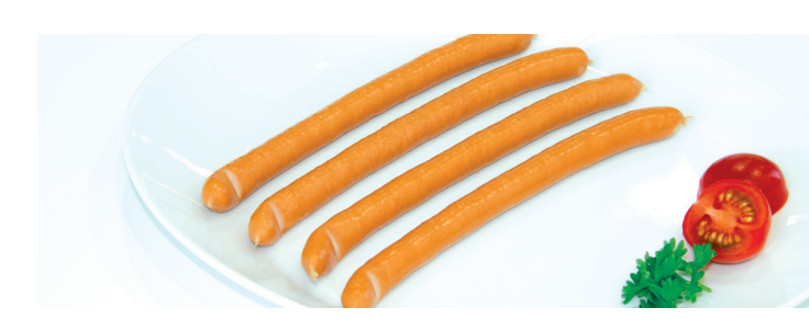
↑ Mini wieners