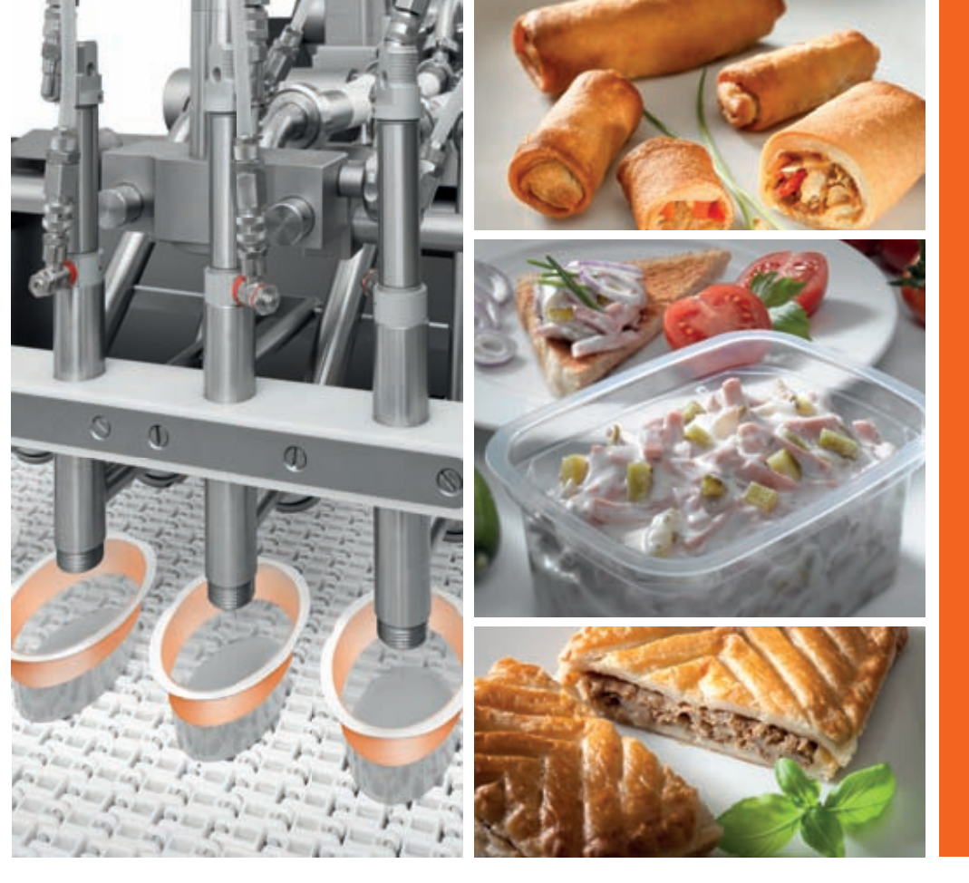
In the Handtmann Forum even unusual, innovative product ideas can be tested. Come and talk to us about your visions.