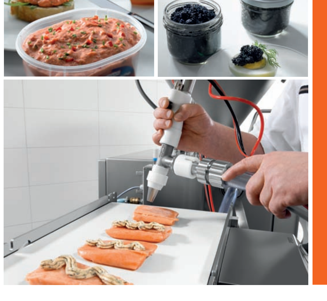
Using its technology, Handtmann is even able to turn unusual ideas for fish, fish products and fillings into products that can be produced reliably. We have the technological solutions for your products.