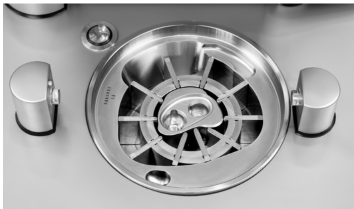
VF 806 S vane cell feed system