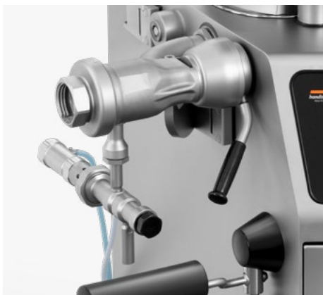
GD 455 inline grinding system with volume separator