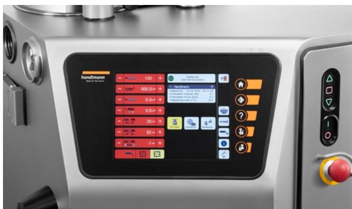
Monitor touch control