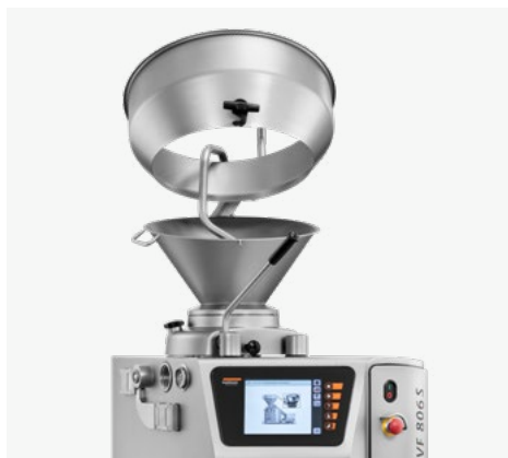
40/100-litre hopper, dividable