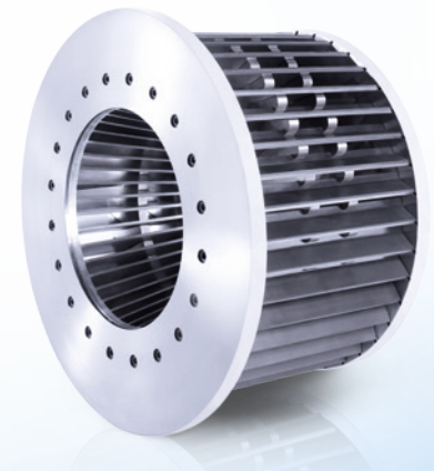
The exchangeable vanes reduce wear-induced life cycle costs and make higher fineness values possible thanks to their geometry.