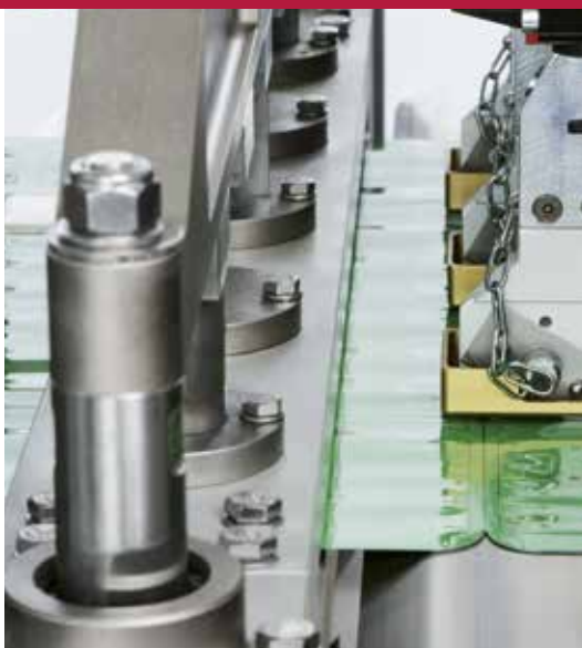
Cutting station and pulling