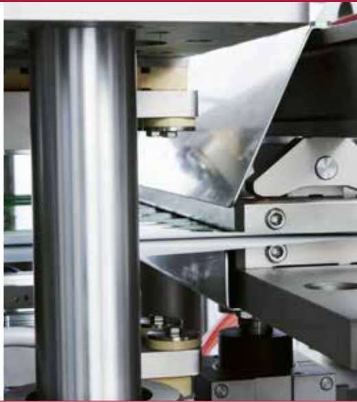
Bottom sealing and cooling