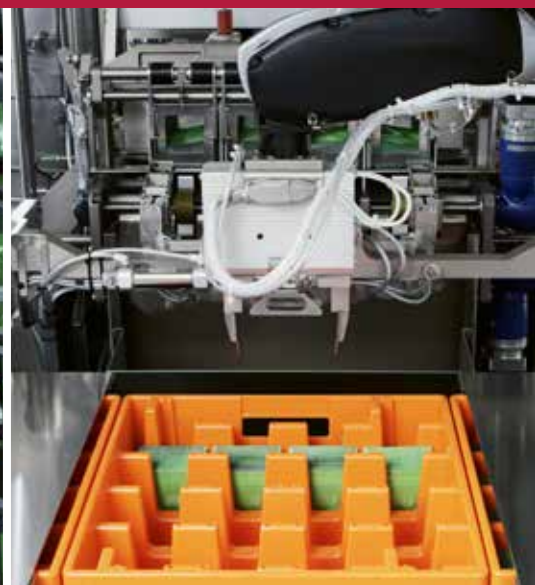
Optional tray loading unit