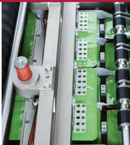
Side cutting, optional stacking unit