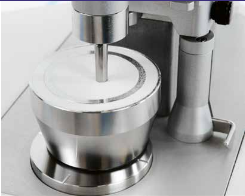
Powder bowl and dosator