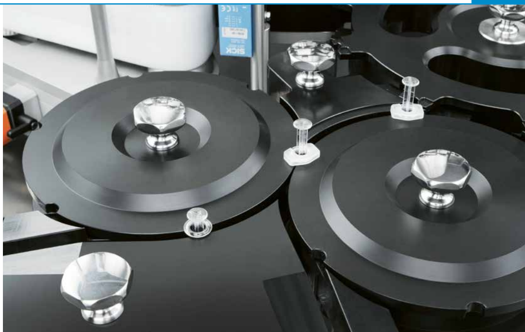
Rejection of non conforming syringes

Rejection is done in the case of a missing plunger rod or its incorrect position, missing label or incorrect overprint, missing backstop. The machine stops after three consecutive rejections caused by the same error.