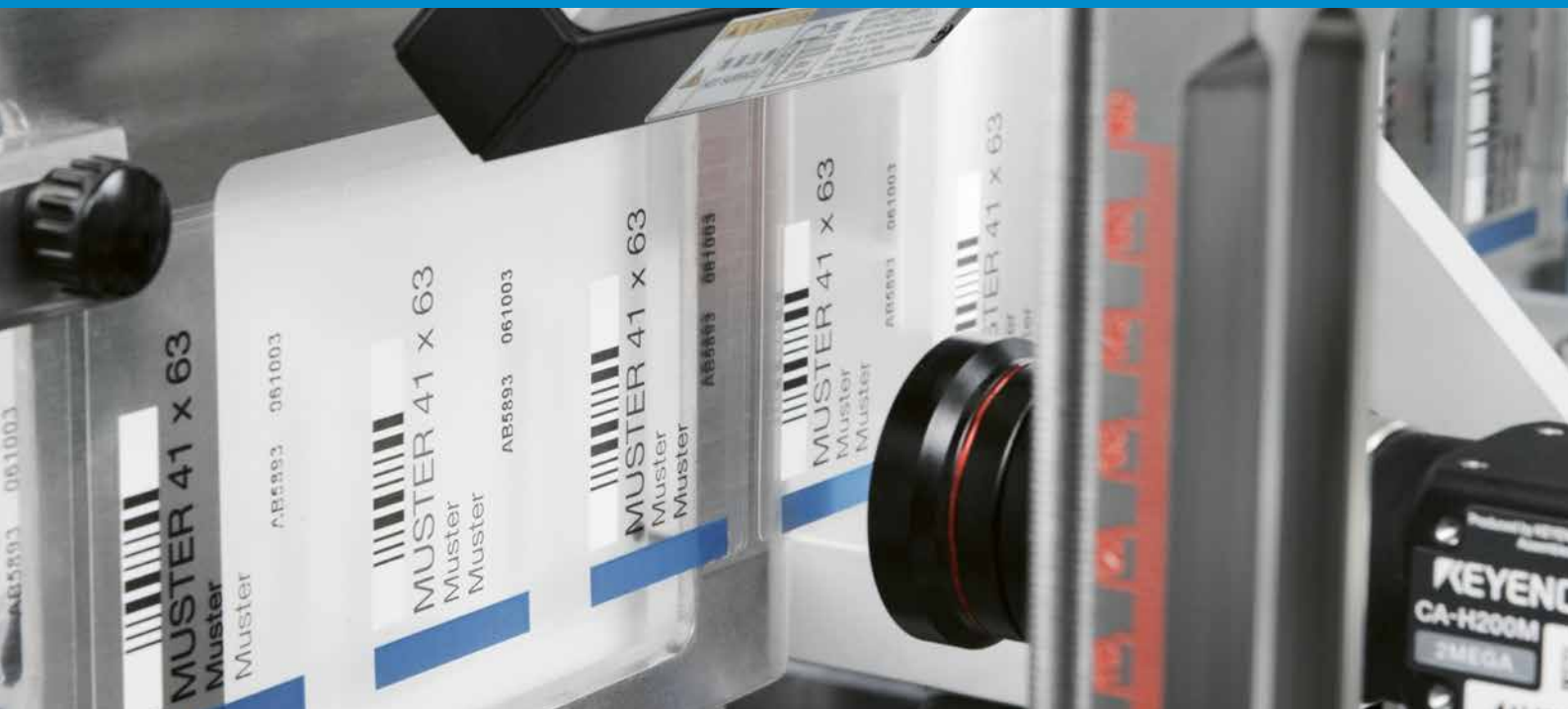
Label overprint control