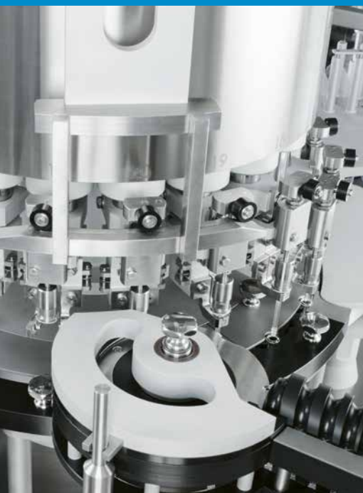
Work area overview