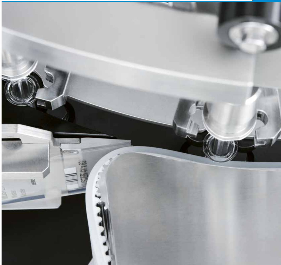
Label application and folding