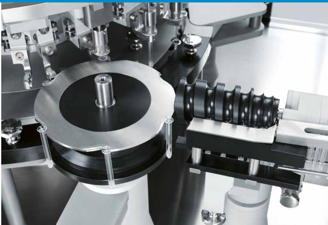
Plunger rod feeding