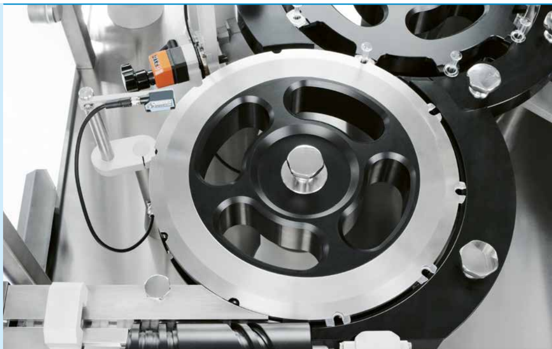
Backstop transport and inserting

The backstops (or finger grips) are loaded in bulk into a vibratory bowl which orientates and feeds them in linear fashion into the machine before pick-up and application on each syringe flange. Two sensors check backstop presence and application.