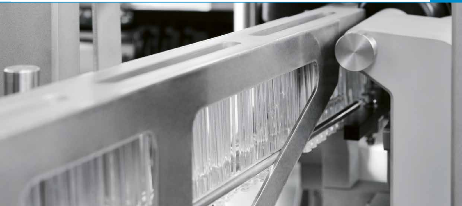
Plunger rod feeding

A brushless motor drives the winding belt rotating the syringe and a mechanical torque limiter avoids plunger damage.