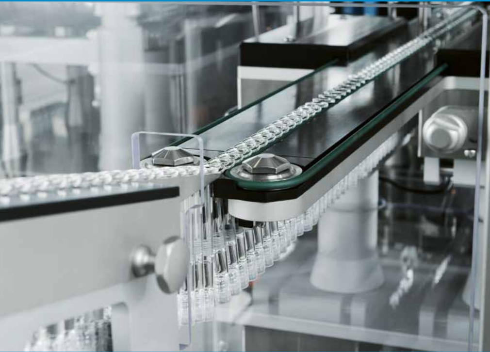
Syringe feeding from denester