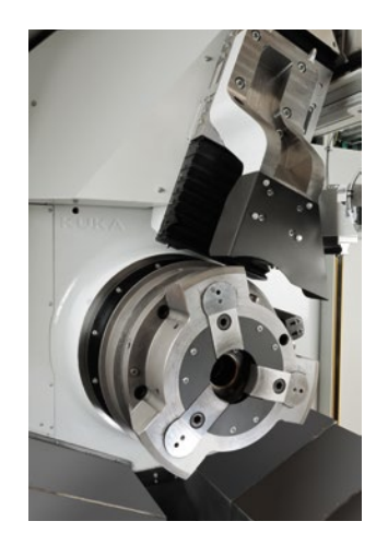
Highly flexible spindle for accommodating different clamping systems and components with a diameter up to 240 mm