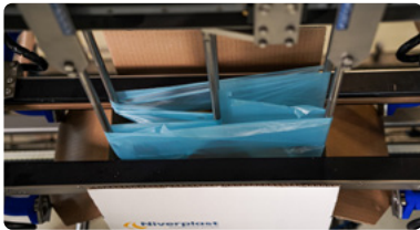
4 Bag spreading and gusseting