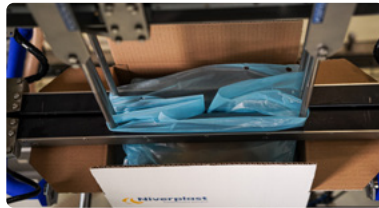
5 Bag sealing