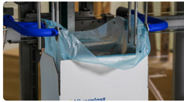
2 Bag pick-up