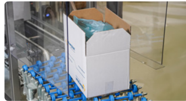
6 Box outfeed