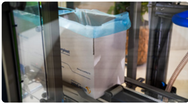
1 Box infeed