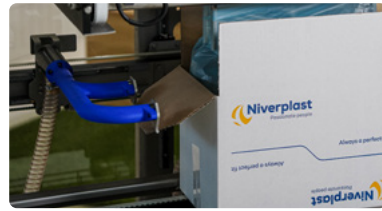
3 Side flap folding