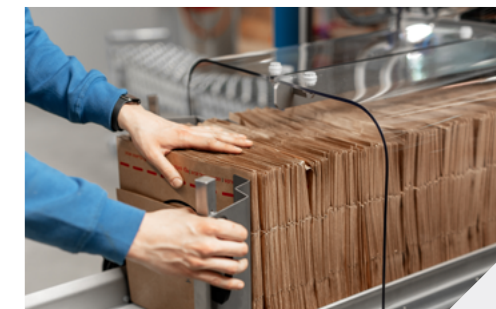
(\mathbf{6}) 24/7 non stop production