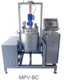
Batch Cooking Batch Processing