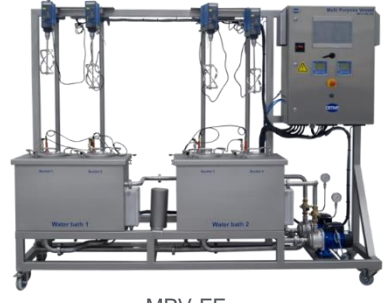
MPV-FE Fermentation Vessel