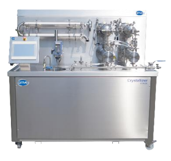
CRA226 Margarine Crystallizer