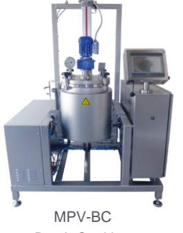
Batch Cooking Batch Processing