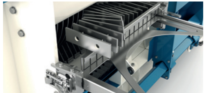
4) Insertion of the new hammers