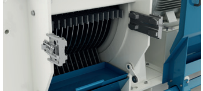
2) Connection of holders for hammer exchange unit