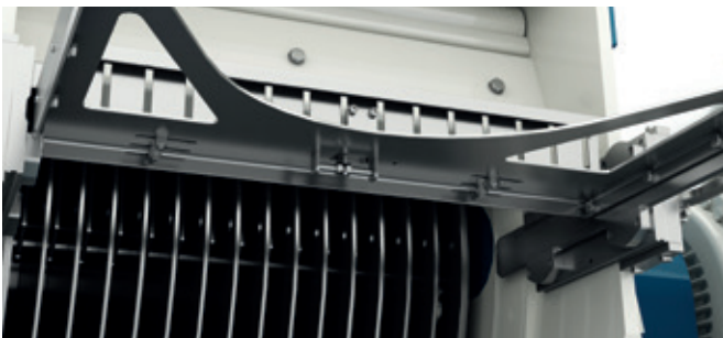
5) Change to second hammer position

Scan the QR-Code for the animation of the QHE