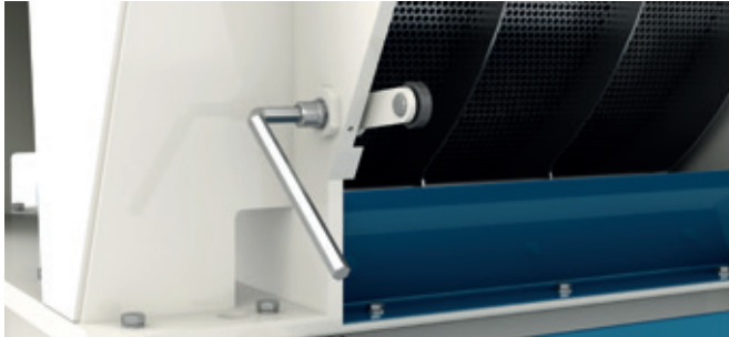
1) Unlock the screen holder

After this the QHE system can be removed. Close the access point for the axle, replace the screen and doors and put on the power. The hammer mill is ready for operation again.