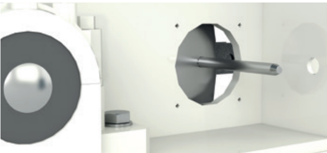
3) Removing the axle