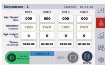
Process Sequence Creation