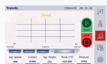
Real-time Process Values