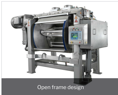
Open frame design