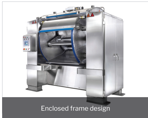
Enclosed frame design