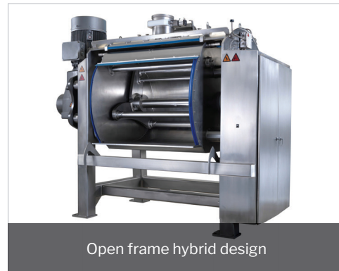
Open frame hybrid design