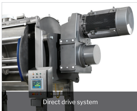
Direct drive system