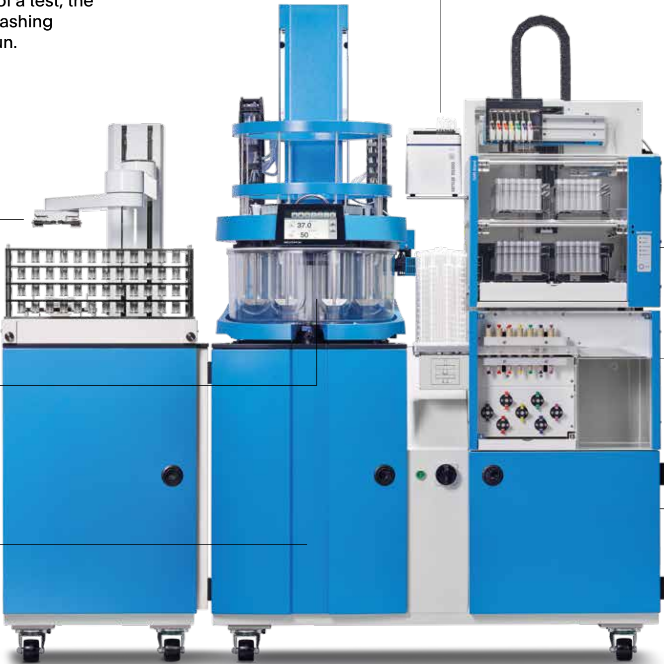
RS Robotic Station