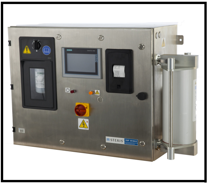
(Typical only - some details may vary.)

Printer . An impact printer with paper take-up is available to provide cycle records, machine configuration data, and calibration values.