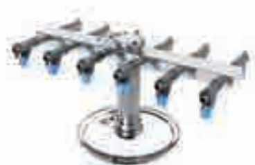
Stackable 12 port manifold with adaptor plate