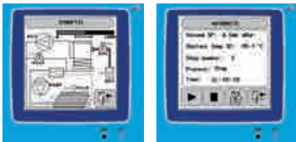
LyoAlfa 10/15 control panel screens

This model incorporates unique and high level control performances, as well as excellent technical features.