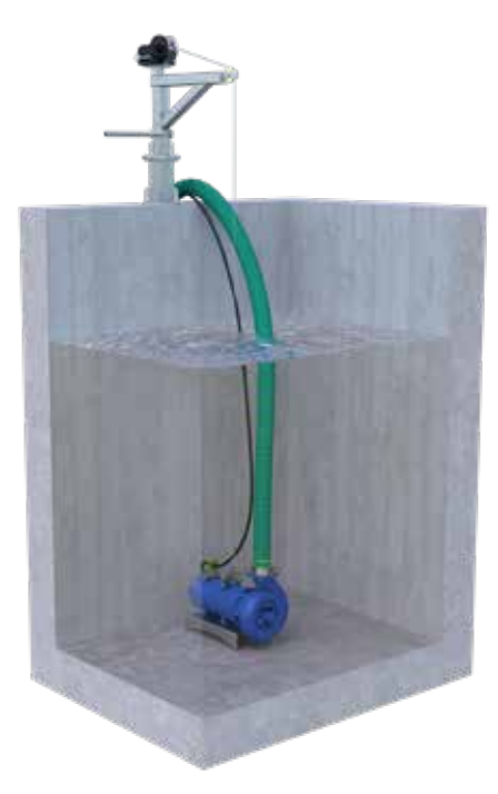
Free-standing horizontal installation