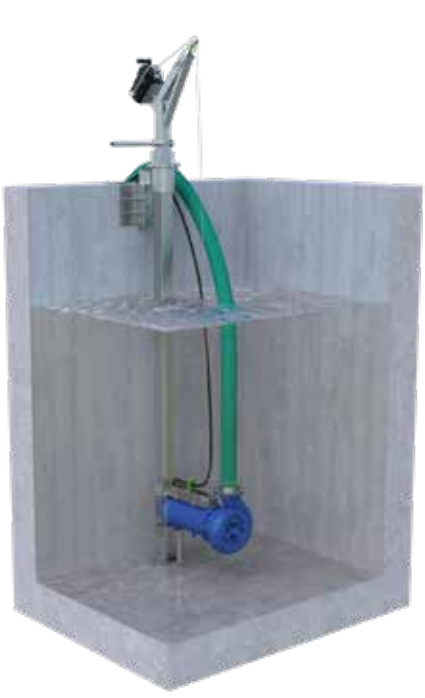
Horizontal pole-mounted installation

Its compact design and reduced overall dimensions make the pump easy to handle and install. The SPB range is available with a variety of accessories suitable for multiple applications. The CHIOR® SPB submersible chopper pumps can be installed horizontally in various configurations, either fastened to a vertical pole fixed to the tank or free-standing on the bottom of the tank.